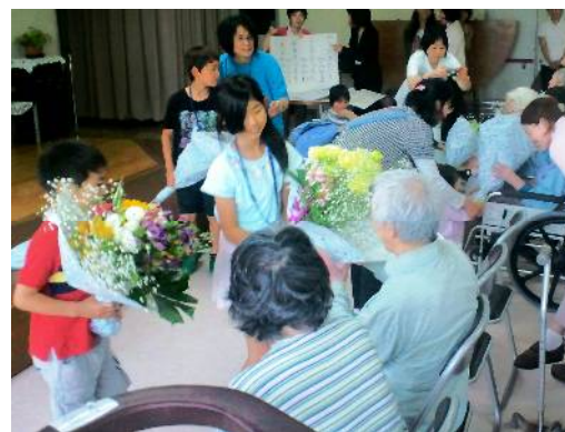
Visiting a Nursing Care Home